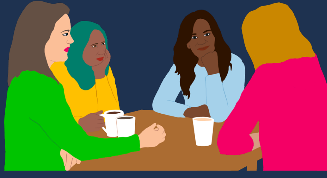
Women's ERG Journey from Grassroots Group to Change-Oriented Network